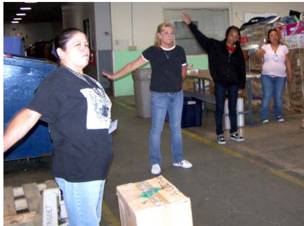
Work it Girls! Production crew beginning their morning exercises.

Exercising is not mandatory, but in a recent Safety Committee this was brought up and left up to the Committee if they so choose to do them.